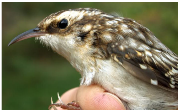
Brown Creeper.

It is in the spirit of sharing bird stories that we celebrate our 30 years at the service of birders. Centre de conservation de la faune ailée / Nature Expert, in cooperation with Regroupement Québec Oiseaux is proud to launch the contest: Bird Stories.